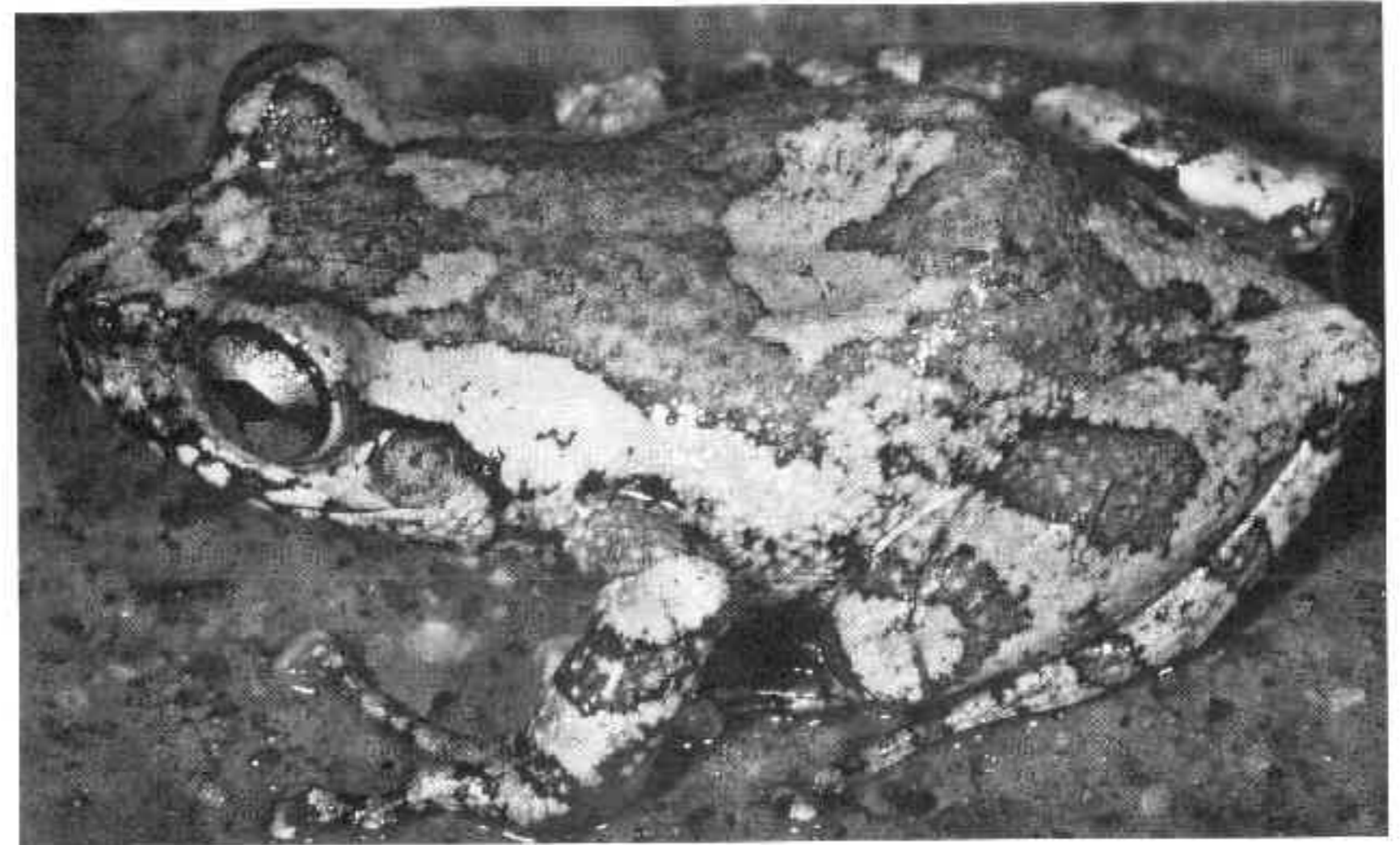
Fig. 1. Boophis xenophilus sp. nov. holotype, dorsolateral view.