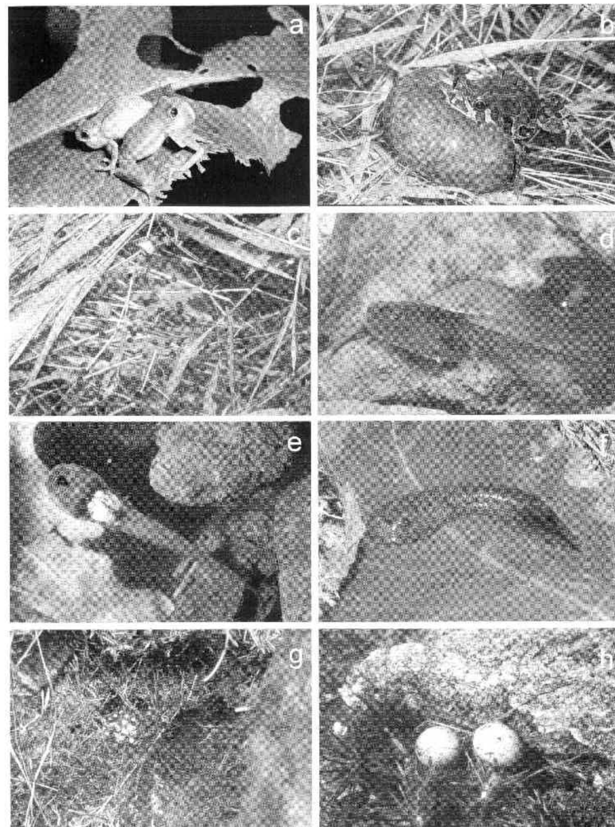
Fig. 3 - Aspects of reproductive biology in the Ankaratra herpetofauna: a, fighting males of Heterixalus betsileo , Manjakatomp; b, calling male of Scaphiophryne madagascariensis , Manjakatomp; c, eggs of S. madagascariensis , Manjakatomp; d, tadpole of S. madagascariensis , Manjakatomp; e, tadpole of Boophis ankaratra , Nosiarivo; f, tadpole of B. williamsi , Ambohimirandrana (ZSM 802/2001); g, clutch of Plethodontohyla tuberculata in jelly nest under a stone, Nosiarivo; h, clutch of Tygodactylus mirabilis , Tsiafajavona Plateau.

MNHN 1973.1041-1046 and 1973.1051-1055 (5-7.I.1972, Ambohimirandrana); MNHN 1973.1047-1048 (10.I.1972, Manjakatomp);