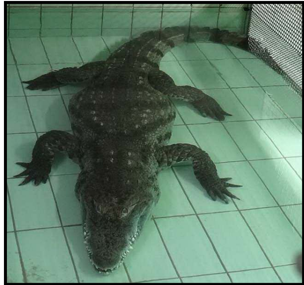
FIGURE 3. One of the “Philippine Crocodiles” from Zurich Zoo (#10; Sulu), Switzerland, which originally was kept at Zoo Wroclaw in Poland from 1980 onwards. It had been acquired from the Czech Zoo Dvur Kralove (from where it was transferred to Switzerland in 2011) and proved to be a Western Nile Crocodile ( Crocodylus suchus) instead of a Philippine Crocodile ( C. mindorensis).

Lastly, the genetic validation of C. mindorensis and the discovery of the C. suchus individual misidentified as C. mindorensis since first acquisition and maintained