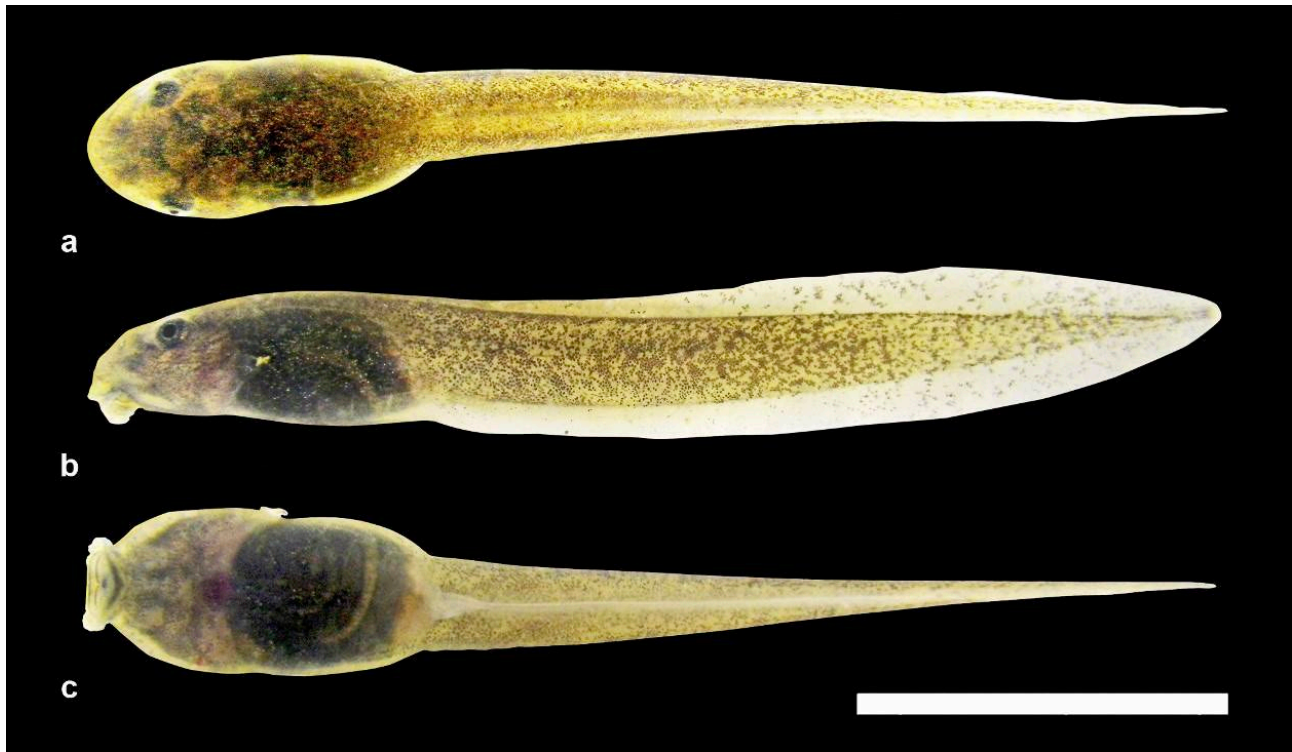
Fig. 1. Images of the living tadpole specimen of Mantidactylus guttulatus (ZCMV 13332 / ZSM 704/2010) at Gosner stage 26; a-c), in dorsal, lateral and ventral view (scale bar = 10 mm).

mal tail height, tail height at body-tail junction lower than body height. Caudal musculature well developed. Tail muscle reaches tail tip. Tail fins very low, dorsal fin slightly lower than ventral fin at mid-tail, but slightly higher in posterior third. Dorsal fin originates slightly behind dorsal body-tail junction, with shallow, gradually rising until the anterior 1/3 of the tail where it increases brusquely to attain its maximal height behind mid-tail and then continues gradually until the posterior 3/4 of the tail where it descends abruptly towards the tail tip. Ventral fin originates at the ventral terminus of the body, rises meticulously until the anterior 1/4 of the tail, and then remains almost parallel to the ventral border of the tail muscle until close to the tail tip. Maximal tail height located behind mid-tail, lateral line vein and myosepta imperceptible, point where the axis of the tail myotomes contacts the body located in the upper half of the body height, axis of the tail myotomes parallel with the axis of body length. Tail tip narrowly rounded. Moderately wide generalized oral disc, positioned almost ventrally and directed anteroventrally, clearly laterally emarginated. Oral disc not visible from dorsal view, upper labium as a continuation of snout. Marginal papillae uniseriate and interrupted by a wide gap on the upper labium, gap on the lower labium absent, total number of mar-