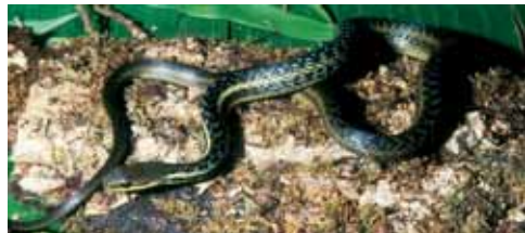
Fig. 5. Liopholidophis epistibes from Andasibe.

venter with three rows of longitudinal dark spots, gradually forming three distinct lines on the posterior two thirds of the venter. Spots/lines are situated midventrally and ventrolaterally. The ventrolateral rows begin on first ventral (preventrals immaculate), the midventral row on ventral 9.