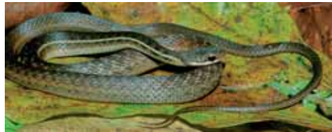
Fig. 4. Liopholidophis stumpffi from the type locality Nosy Be (ZSM 579/2001).