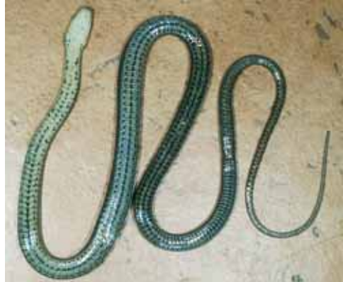
Fig. 3. Ventral view of the holotype of Liopholidophis martae sp. n.

Ground colouration of ventral surfaces of the head, neck, and anterior third of body creamish-white to grey, slightly iridescent. The light ground colouration is gradually suffused with grey to black mottlings on the posterior thirds of the body and tail. Ventral surface of head immaculate. Anterior third of