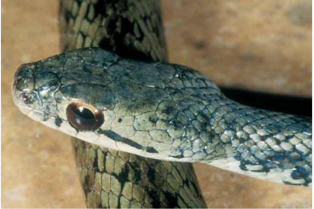
Fig. 1. Portrait of the holotype of Liopholidophis martae sp. n.